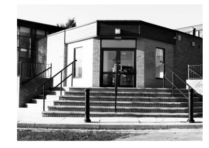
"United in conviction and united in love, with a common purpose and a common mind" Philippians 2:2

Diocese of Shrewsbury Registered Charity No 234025