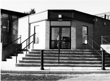
“United in conviction and united in love, with a common purpose and a common mind” Philippians 2:2

St Joseph’s RC Church Woodford Lane Winsford CW7 2JS